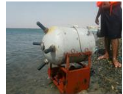
Sea Mine threat – Western coast of Yemen