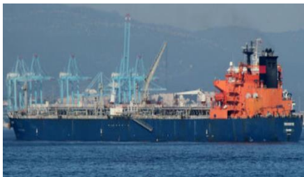
31 May – MV MUSKI