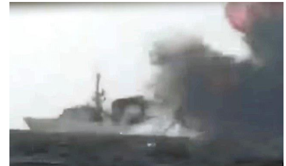
Jan 17 – Al-Madinah