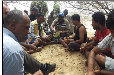
6 Jun 14 – Crew of MV Albedo still held captive